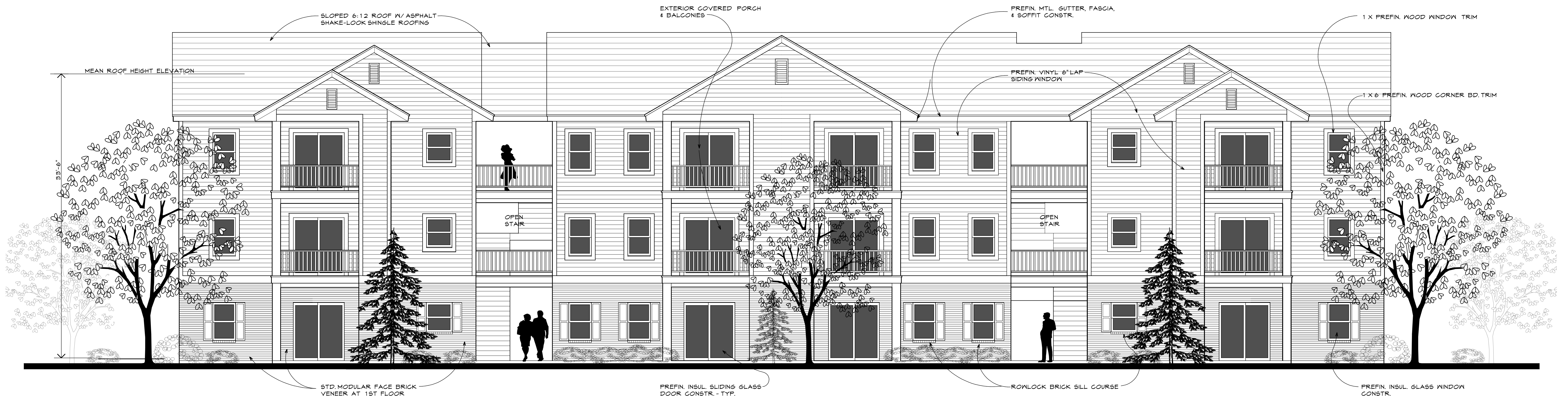
12-unit building elevation 1/4"=1'-0"